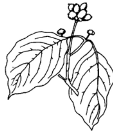
White Flowering Dogwood